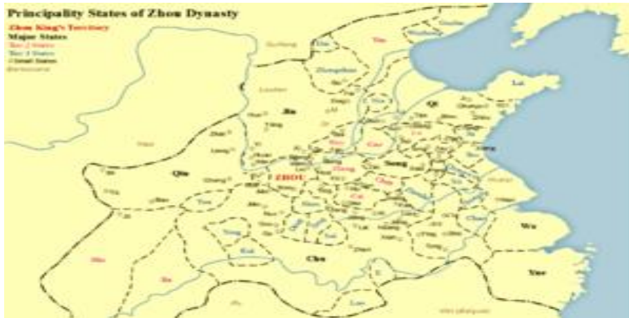
Figure 1: Map showing major states of Eastern Zhou

At first Qin started a military mission in China in 672 BC, it is true that it could not connect in stern incursions because there was hazard from neighbor tribes. In the very start of the fourth century BC, the neighbor had been cowed or some had controlled so the condition was ready for the climbing of Qin expansionism (Guo, 2009; Tan, 2017; Zhao, 2013).