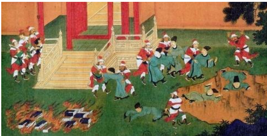
Painting showing burning of books and burying scholars during the Qin Dynasty

An exciting truth is that the Emperor implemented total suppression. Qin ill-treated scholars and smashed books. He said, all book are useless and have no benefit, only medicine and agriculture related books are beneficial. One more noticeable past reality is that 100 scholars who were not agreed to leave their books, were also have to bury alive. After that, expenses for making the Great Wall were more, so they were send to basements to labor until their death.