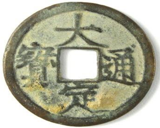
Figure 3: Shape of copper coin